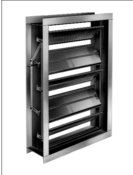
MODEL 5613 Opposed Blade